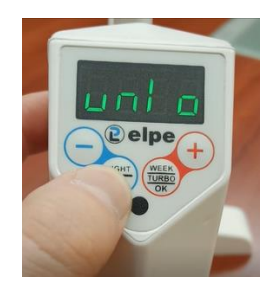
Press three times "NIGHT/ESC" button (within 0,5 sec)

Correctly conducted procedure will be signaled with 'unlo' message at your led screen. After that your keyboard will be activated and ready to work.